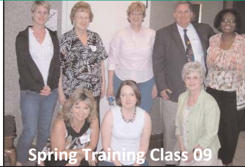
Spring Training Class 09

The spring volunteer training class for the Ridgeland office the first weekend in June. Nine trainees passed the requirements for volunteering and have gone to work for Hospice Ministries in their related fields.