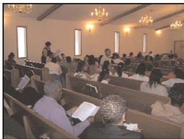
start of the festival.

The final performances by the Westhaven Funeral Home Choir of Jackson was the Festival's crowning glory.