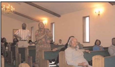
Festival guests were moved by the toe tapping and hand clapping music that was the norm of the evening.