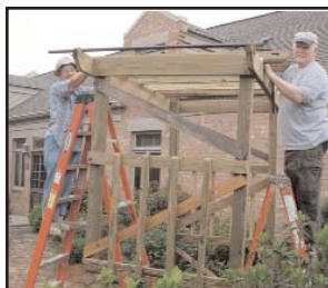
A Special Thank You!