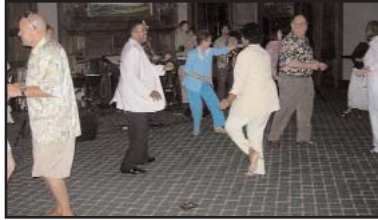
Guest danced the night away.

The beginning of laid back summer days was ushered in on Friday, May 19 by guests as they danced to the music