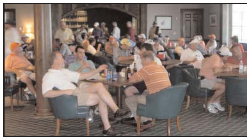
Right: During the break between rounds the golfers take a break waiting for the next tee off at 1:00 p.m.

A Sky Caddie, GPS Hole Funder provided by Sky Golf was up for grabs for closest to the hole. Breakfast was provided by Crystal Fuqua, lunch featured sandwiches from Chick-Fil-A, and at the end of the day Mexican dishes were provided by On The Border.