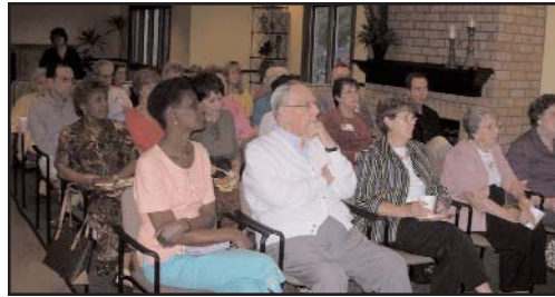
Volunteers listening about new awards

A group of 26 volunteers gathered to receive their awards for the year 2005. Volunteers represented different areas, including administration, patient care and gardening. With so many talented and truly wonderful volunteers, it was difficult to choose the best in each category.