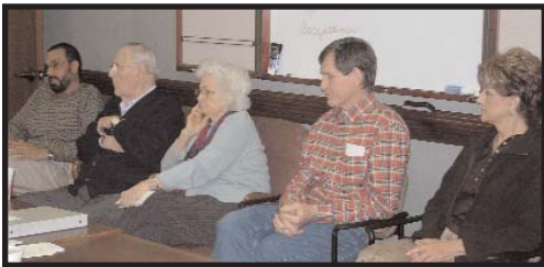
A favorite part of the training is the volunteer panel, where active volunteers come and describe some of their visits with patients, or their duties as volunteers.